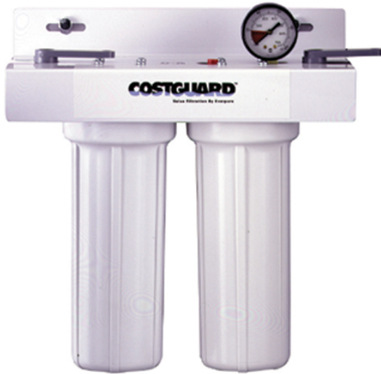
CGS-12 10" Dual Series Housing: DEV9100-12