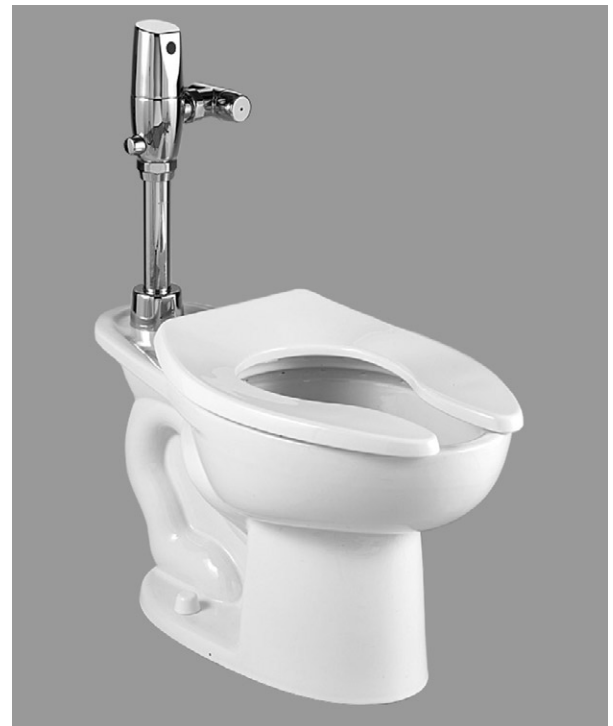
SEE REVERSE FOR ADDITIONAL ROUGHING-IN DIMENSIONS