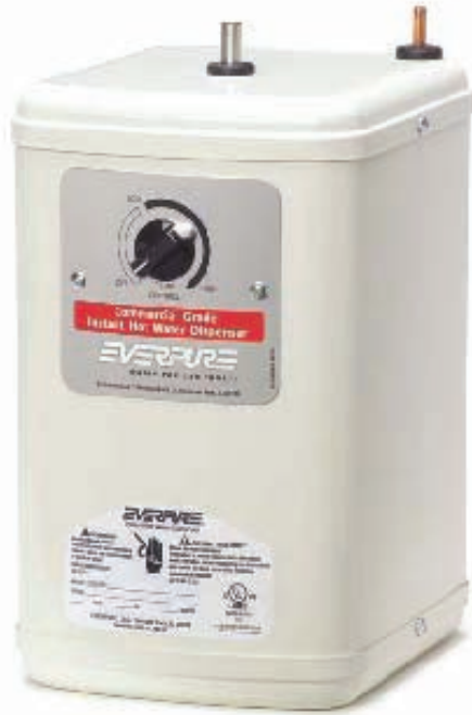
Solaria Water Appliance: EV9318-40

Low volume premium water appliance for drinking water applications